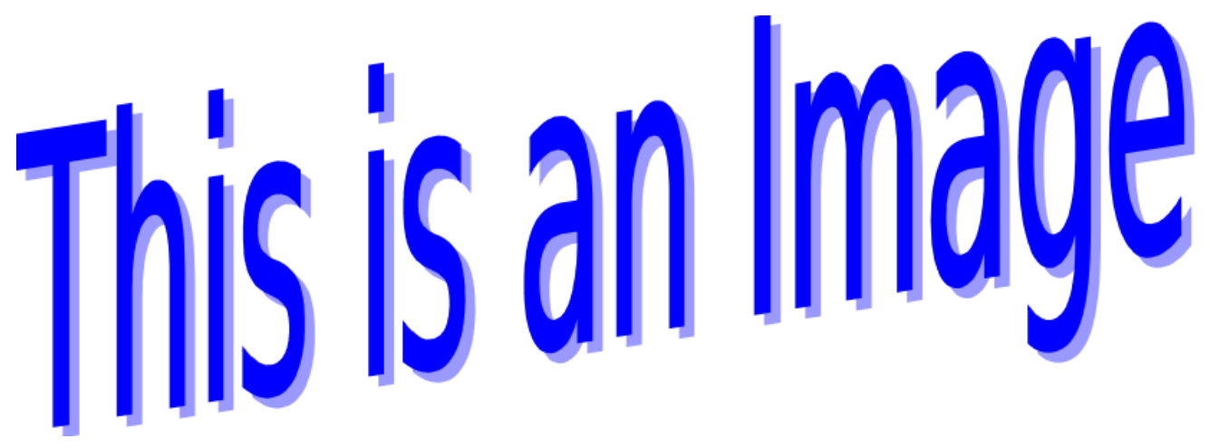
Fig. 1: This is the caption of an image. It describes the content of the illustration or graph.

Nulla malesuada porttitor diam. Donec felis erat, congue non, volutpat at, tincidunt tristique, libero. Vivamus viverra fermentum felis. Donec nonummy pellentesque ante. Phasellus adipiscing semper elit. Proin fermentum massa ac quam. Sed diam turpis, molestie vitae, placerat a, molestie nec, leo.